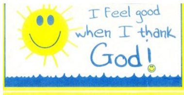
ST. MARY'S - ST. ANTHONY - ASSUMPTION

WorldWide MARRIAGE ENCOUNTER: "Even now, says the Lord, return to me with your whole heart; for I am gracious and merciful." Call on our merciful God to make your marriage holy and joyful. Join us on the upcoming Worldwide Marriage Encounter Experience on May 27-29 at Our Lady of Peace Retreat House in Beaverton, Oregon. To apply for YOUR WWME Experience or search other dates go to rediscoverthespark.org . For information about WWME call 503-704-0836 or by email at reservations@rediscoverthespark.org