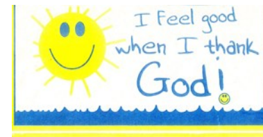
ST. MARY'S - ST. ANTHONY - ASSUMPTION

WorldWide MARRIAGE ENCOUNTER: "Even now, says the Lord, return to me with your whole heart; for I am gracious and merciful." Call on our merciful God to make your marriage holy and joyful. Join us on the upcoming Worldwide Marriage Encounter Experience on May 27-29 at Our Lady of Peace Retreat House in Beaverton, Oregon. To apply for YOUR WWME Experience or search other dates go to rediscoverthespark.org . For information about WWME call 503-704-0836 or by email at reservations@rediscoverthespark.org