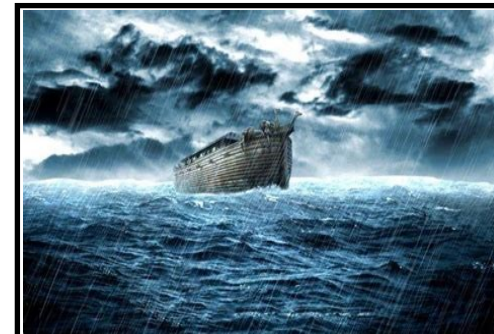
"They did not know until the flood came ..."