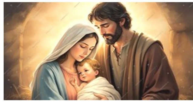
February is the Month of the Holy Family