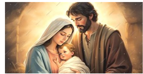
February is the Month of the Holy Family