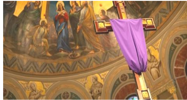
40 Days of Lent: Pray, Fast, Give