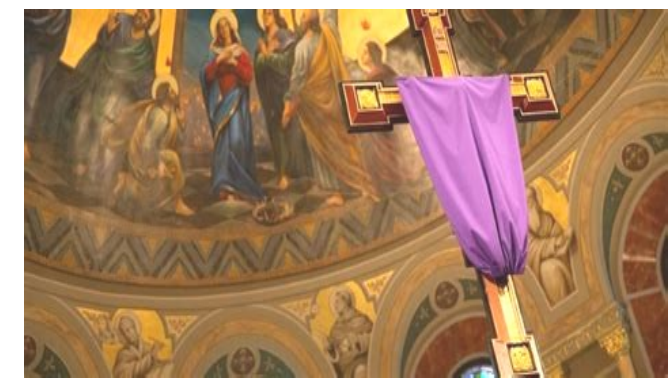
40 Days of Lent: Pray, Fast, Give