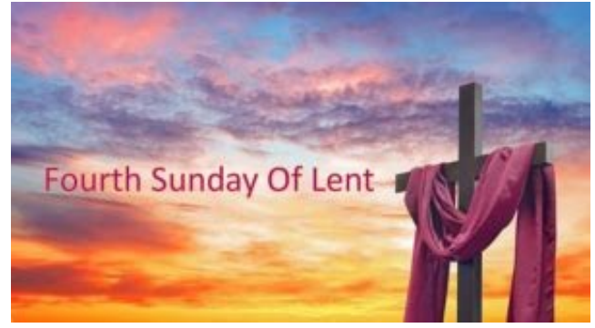
40 Days of Lent: Pray, Fast, Give