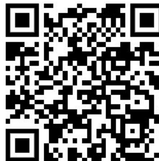
Holy Cross Signup 2026