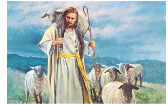
Good Shepherd Sunday