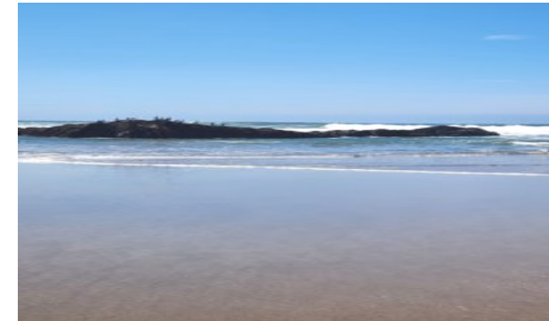
Father's picture of Ocean showing the birds on the rock